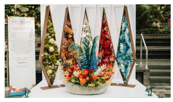
Floral display by Berlinda Tan: "Resonance of the Past: A Contemporary Symphony of Singapore's Legacy" features the former National Theatre of Singapore with its iconic diamond-shaped façade and crescent-shaped bowl fountain.