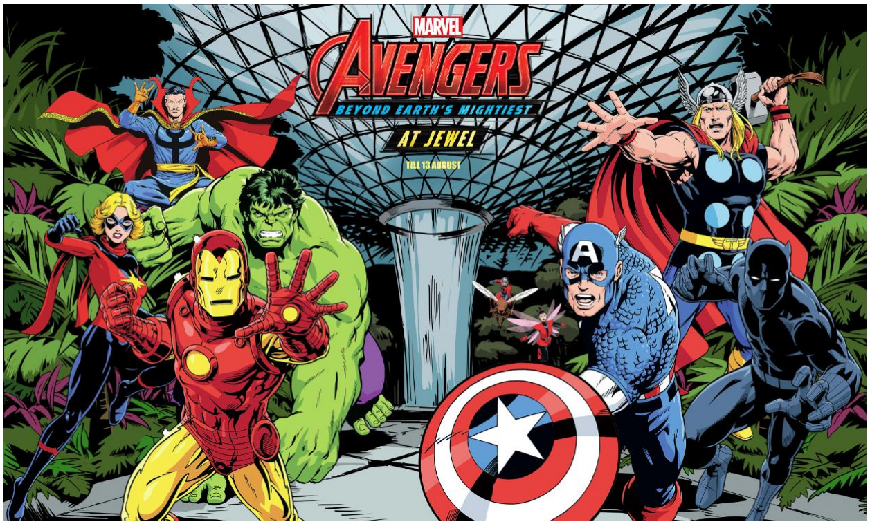
Avengers: Beyond Earths' Mightiest at Jewel will take place from 26 May to 13 August 2023

Singapore, 25 May 2023 – Fans and enthusiasts of The Avengers will be able to see Earth's Mightiest Heroes at a large-scale Marvel-themed event at Jewel Changi Airport (Jewel). Avengers Assemble @ Shiseido Forest Valley showcases some of the popular Avengers with 3D installations and interactive displays. Avengers Forever @ Canopy Park pays homage to 60 years of Avengers by featuring key milestones of the Avengers from comic books to television, toys and movies. The entire event – Avengers: Beyond Earths' Mightiest at Jewel – will be held from 26 May to 13 August 2023.