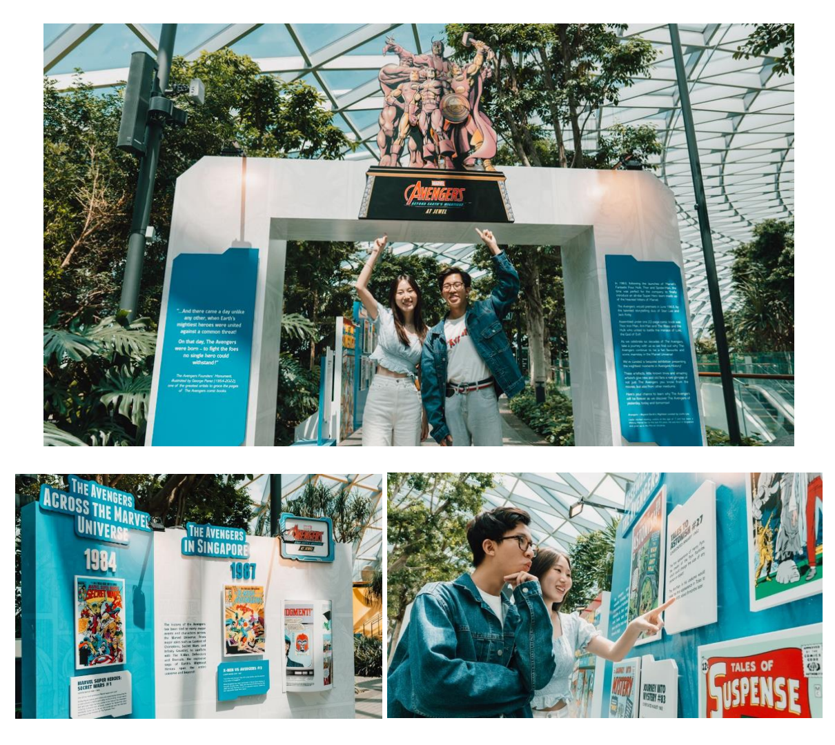
Marvel Avengers celebrates its 60<sup>th</sup> anniversary this year and this exhibit highlights the major milestone of its history.

Avengers Forever @ Canopy Park celebrates six decades of the Avengers through enthralling exhibits that narrate the history of the Avengers which is tied to many major events and characters across the 60 years. From major epic titles such as Contest of Champions , Secret Wars and Infinity Gauntlet , to conflicts with X-Men , Defenders and Eternals , the saga of Earth's Mightiest Heroes spans the entire universe and beyond.