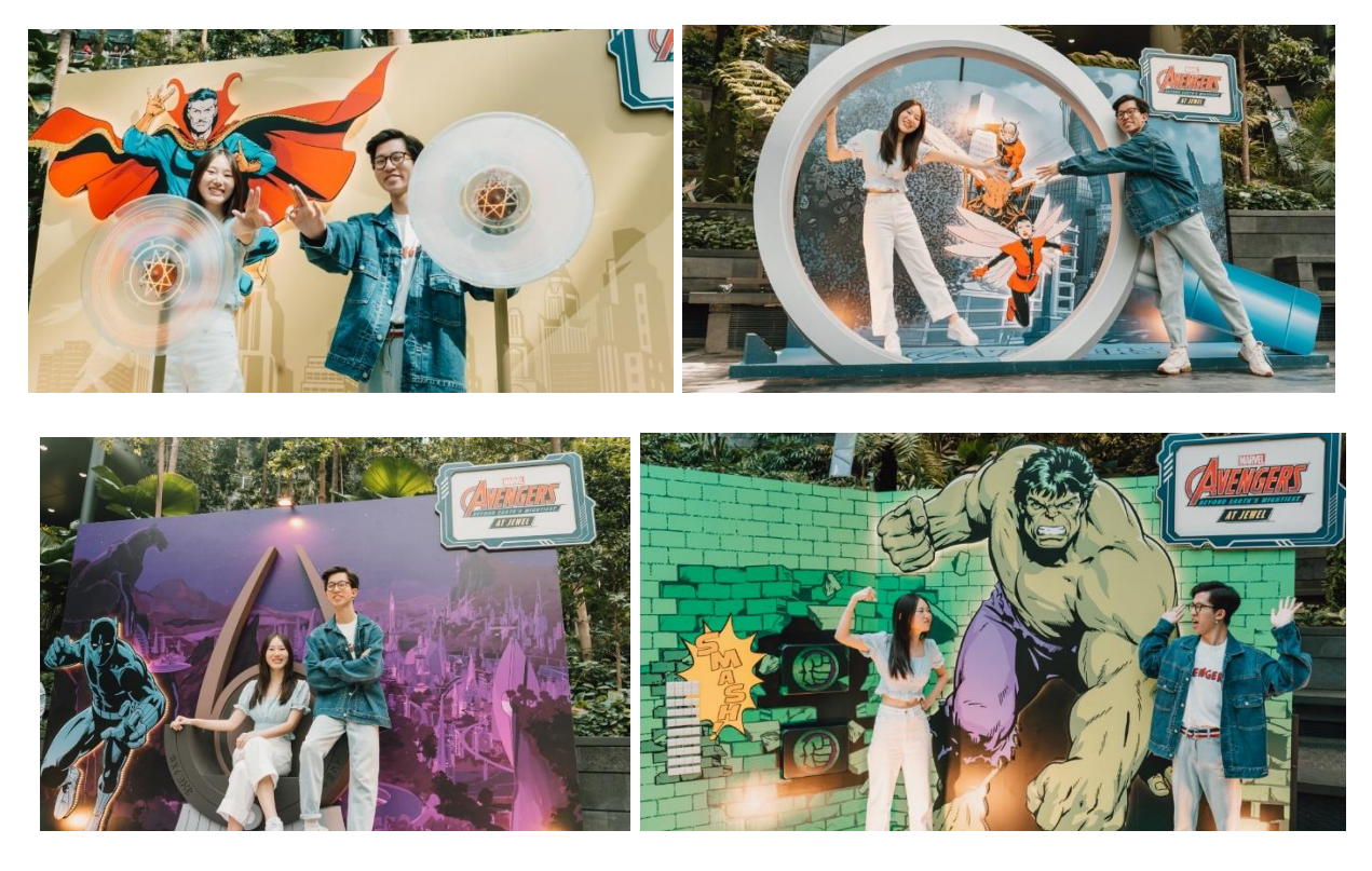
Enthralling Marvel Avengers photo spots around the Shiseido Forest Valley

The other four interactive displays feature The Incredible Hulk, Doctor Strange, Ant-Man and the Wasp, and Black Panther. Visitors can measure themselves against The Incredible Hulk in a battle of strength by punching against the strength meter, activate the holographic fans and defend from mystical threats like Doctor Strange , strike a pose on the throne at the Black Panther display, and get spotted with Ant-Man and The Wasp as they shrink themselves down against a life-size magnifying glass.