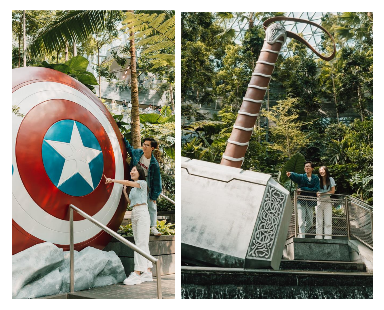
Marvel at the ginormous 3D displayes featuring Captain America's indestructible Vibranium Shield and Thor's mighty Mjolnir

At Jewel's Shiseido Forest Valley main entrance, a 5-metre red and gold statue of Iron Man stands tall.