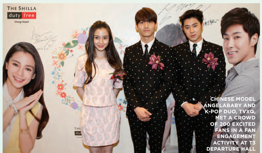
CHINESE MODEL ANGELABABY AND K-POP DUO, TVXQ, MET A CROWD OF 200 EXCITED FANS IN A FAN ENGAGEMENT ACTIVITY AT T3 DEPARTURE HALL