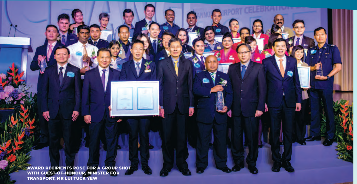
AWARD RECIPIENTS POSE FOR A GROUP SHOT WITH GUEST-OF-HONOUR, MINISTER FOR TRANSPORT, MR LUI TUCK YEW