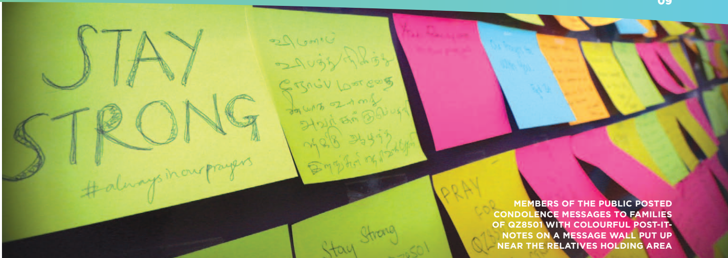
MEMBERS OF THE PUBLIC POSTED CONDOLENCE MESSAGES TO FAMILIES OF QZ8501 WITH COLOURFUL POST-IT-NOTES ON A MESSAGE WALL PUT UP NEAR THE RELATIVES HOLDING AREA