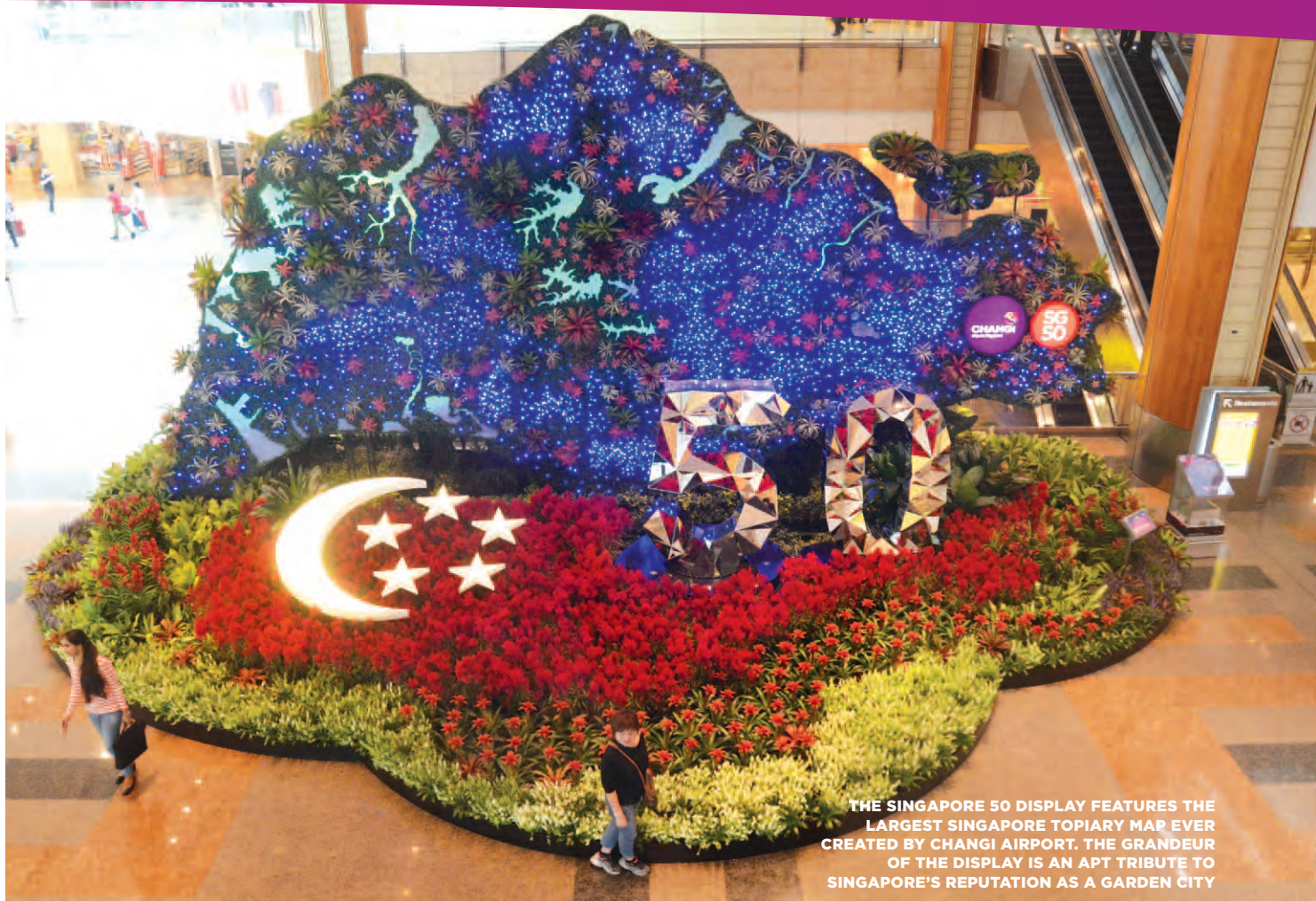
THE SINGAPORE 50 DISPLAY FEATURES THE LARGEST SINGAPORE TOPIARY MAP EVER CREATED BY CHANGI AIRPORT. THE GRANDEUR OF THE DISPLAY IS AN APT TRIBUTE TO SINGAPORE'S REPUTATION AS A GARDEN CITY