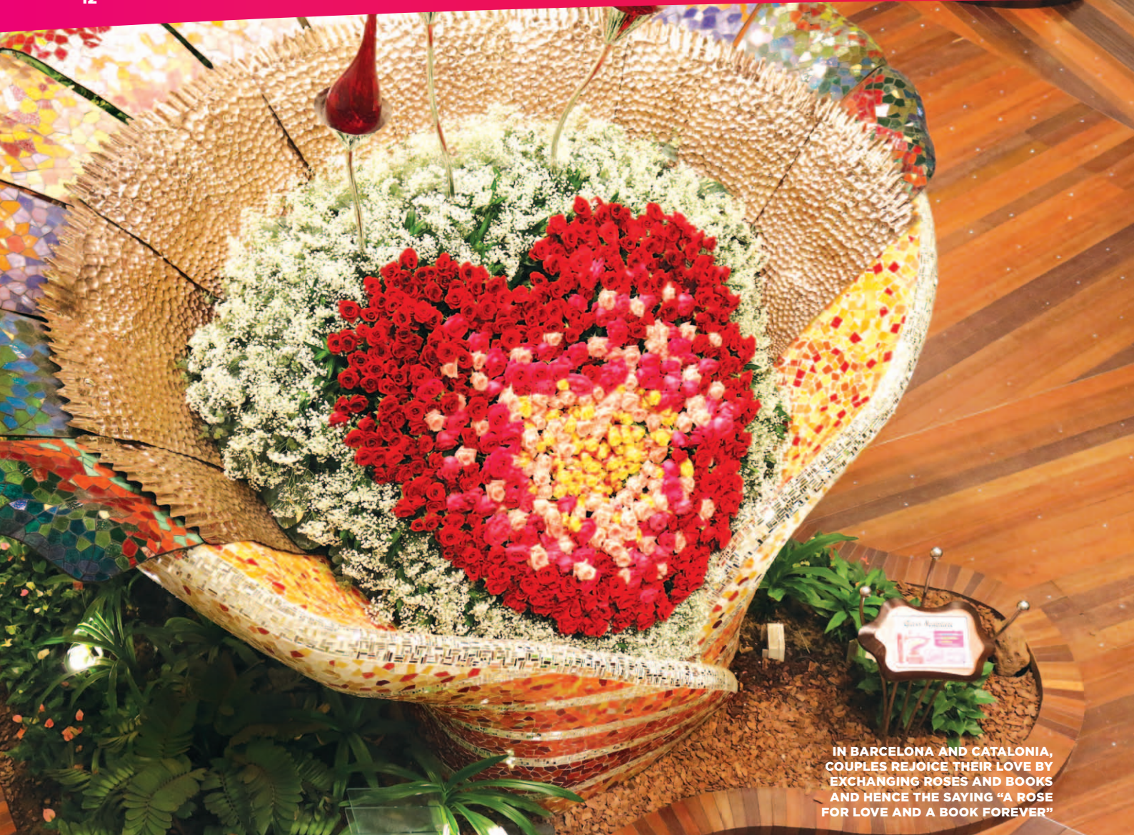
IN BARCELONA AND CATALONIA, COUPLES REJOICE THEIR LOVE BY EXCHANGING ROSES AND BOOKS AND HENCE THE SAYING "A ROSE FOR LOVE AND A BOOK FOREVER"